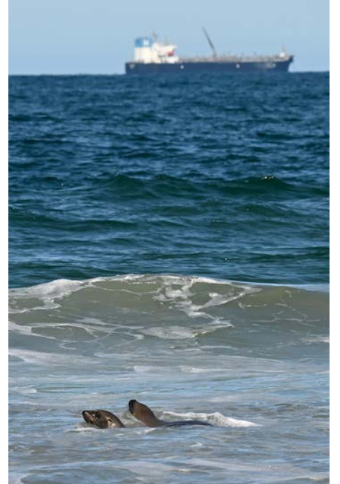
Two sea lion pups swim away in Manhattan Beach after being released by the Marine Mammal Care Center on Friday.

pup, was rescued April 13 from El Segundo after appearing to be emaciated when spotted. Malnourished and dehydrated when he arrived at the hospital, he rebounded after a few days of care and being able to eat whole fish after being tube-fed. Some pox lesions