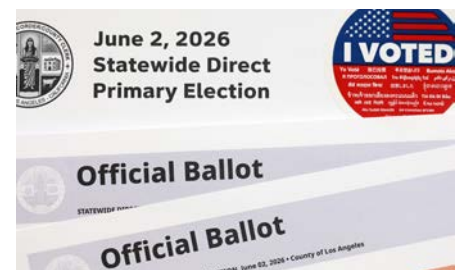
In this photo illustration, a view of official vote-by-mail ballots and voter materials for the 2026 California primary election on May 4 in Pasadena.