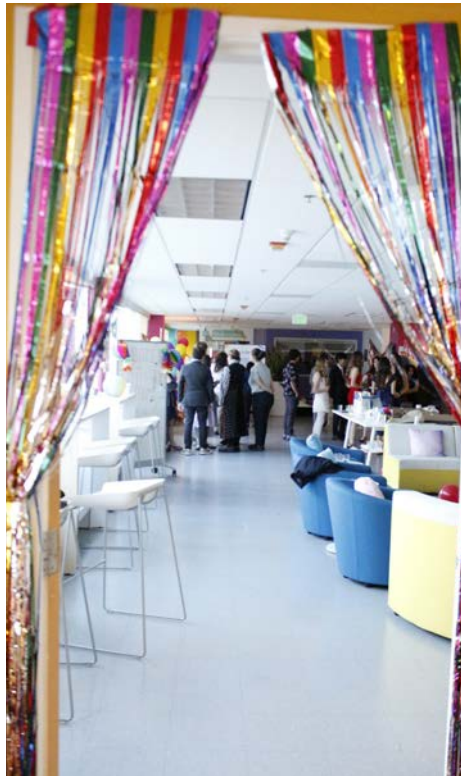
A queer prom hosted by juniors at Mira Costa High allowed South Bay LGBTQ+ teens to be themselves freely, attendees said.