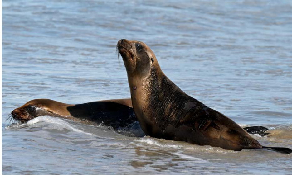
Two sea lion pups make their way to the ocean in Manhattan Beach after getting nursed to health by the Marine Mammal Care Center on Friday.

-Rotini, a female California sea lion pup, was also rescued from Dockweiler on April 12 after a beach cleanup crew spotted her looking emaciated. Malnourished and dehydrated