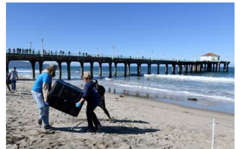
Volunteers with the Marine Mammal Care Center MMCC help with the release of three sea lion pups in Manhattan Beach on Friday.

on his neck resolved and after six weeks he doubled in size.