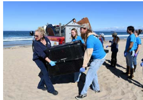
Volunteers with the Marine Mammal Care Center MMCC help with the release of three sea lion pups in Manhattan Beach on Friday.

pup, was rescued April 13 from El Segundo after appearing to be emaciated when spotted. Malnourished and dehydrated when he arrived at the hospital, he rebounded after a few days of care and being able to eat whole fish after being tube-fed. Some pox lesions