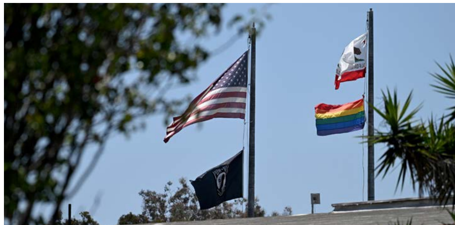
The LGBTQ+ Pride flag flies over city hall after its official raising in commemoration of Pride Month in Hermosa Beach on Monday.