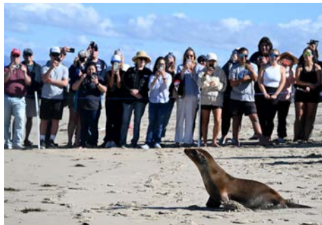
One of three sea lion pups makes its way to the ocean in Manhattan Beach after getting nursed to health.

when she arrived at the care center, she was tube-fed mashed fish and then transitioned to whole fish. After six weeks under care, she gained weight and was cleared for release back into the wild.